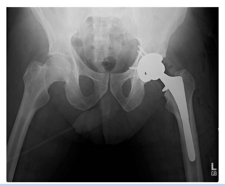
Figure 3. Bilateral hip plain radiography demonstrating left total hip replacement for osteoarthritis.

and bilateral hip radiographs 2 weeks postoperatively also confirmed the adequate radiographic length of the patient's left total hip arthroplasty (Figure 3). Clinically, however, the patient felt that his left leg was longer than the right postoperatively, and subsequent clinical evaluation documented a 3/4-inch leg length discrepancy (left longer than right). Although his preoperative symptoms completely resolved, and the patient quickly returned to a full and unrestricted lifestyle, the LLD was a persistent complaint. The patient was eventually fitted with a 5/8-inch shoe lift to address the LLD.