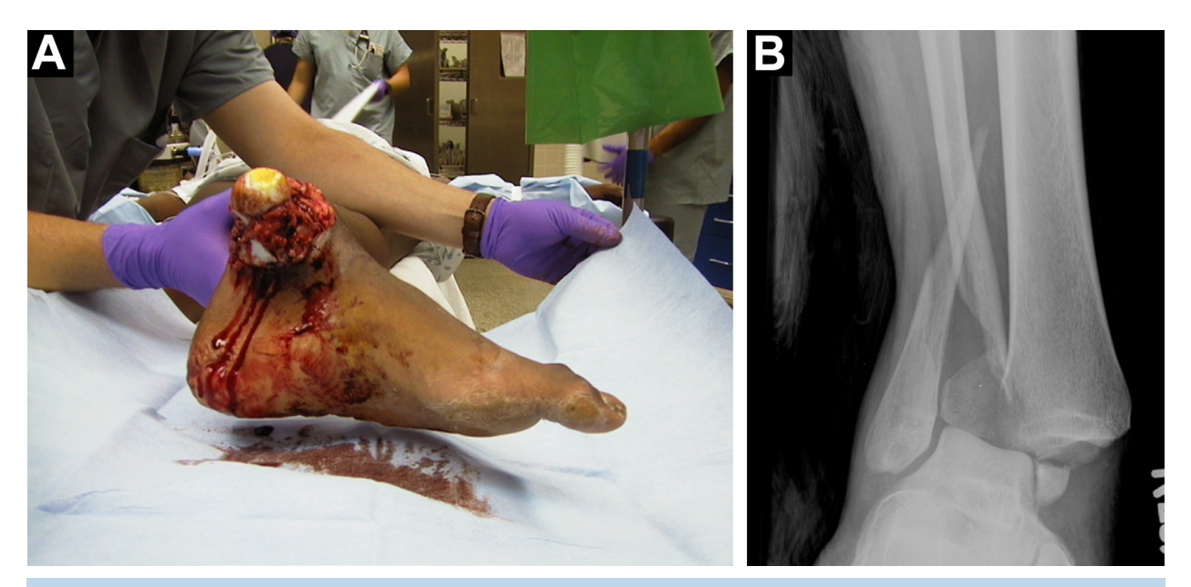
Figure 1. Clinical presentation ( A ) and plain radiography ( B ) of severe open fracture dislocation of the ankle.

Our protocol consists of initial trauma room evaluation by the orthopaedic resident (Figure 1). The patient is assessed in the emergency room (ER) and the distal neurovascular status is established. The dislocations that were not grossly contaminated are reduced under intravenous analgesia and sedation and a padded trilaminar splint applied as temporary immobilization. Betadine dressings are placed over grossly contaminated open injuries that are splinted without reduction. The intravenous antibiotics (eg, ancef 2g, gentamicin 5mg/kg) and tetanus prophylaxis are administered before the patient leaves the ER. Grossly contaminated wounds also receive 4 million units of penicillin. The patients then are taken to the operating room (OR) emergently for irrigation, surgical exploration, and debridement, followed by skeletal stabilization.